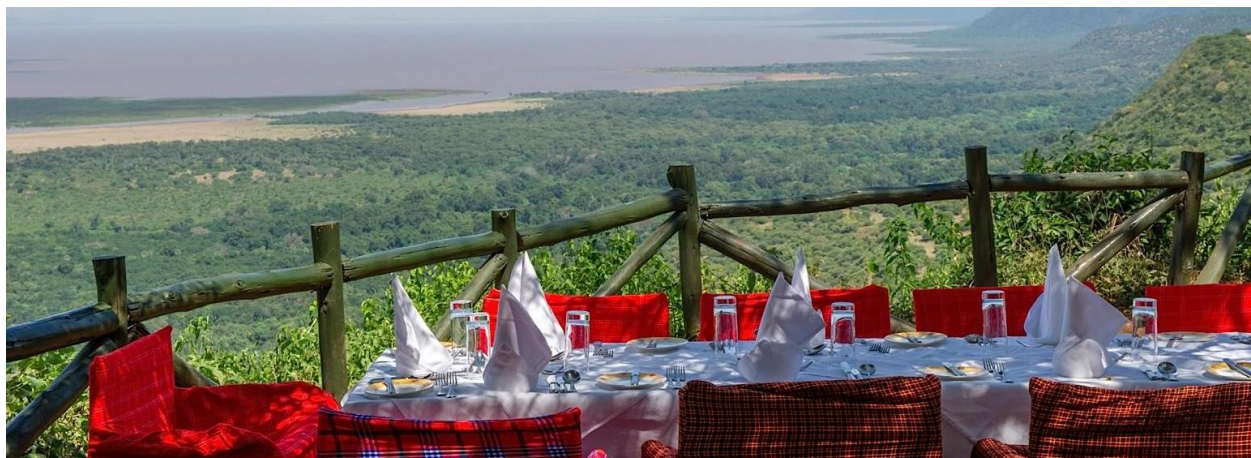
Overnight at Lake Manyara Serena safari lodge

From the entrance gate, the road winds through an expanse of lush jungle-like groundwater forest where hundred-strong baboon troops lounge. Lake Manyara's game includes good numbers of elephant, buffalo and wildebeest along with plenty of giraffe. Also prolific in number are zebra, waterbuck, warthog and impala. You may need to search a little harder for the small and relatively shy Kirk's dik-dik, and klipspringer on the slopes of the escarpment. The broken forests and escarpment make it good country for leopard, whilst Manyara's healthy lion population are famous for their tree-climbing antics. (Whilst unusual, this isn't as unique to the park as is often claimed.) As with the habitats, the birdlife here is exceptionally varied. In the middle of the lake you'll often see flocks of pelicans and the pink-shading of distant flamingos, whilst the margins and floodplains feed innumerable herons, egrets, stilts, stalks, spoonbills and other waders. With so much water around, the woodlands are equally productive, but it's the evergreen forests where you'll spot some more entertaining species such as the noisy silvery-cheeked hornbills, crowned eagles and crested guinea fowl.