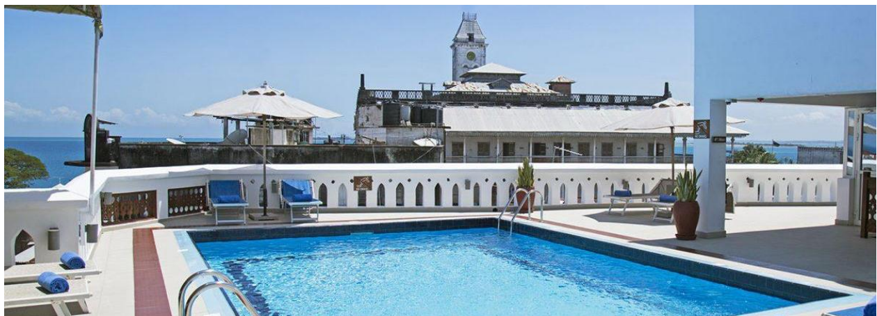
Overnight at Maru Maru Hotel

This City tour is one among the hot day tours in Zanzibar island, it is the only opportunity to discover the historical sites, curio shops, dilapidated buildings, cosmopolitan people shopping.