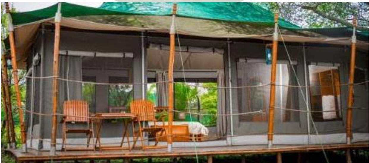
Overnight at Embalakai Authentic Camp

Some of these animals reside permanently in home areas, which are excellent for safaris all year round. But most of the wildebeest and good numbers of other species are permanently on the move in the 'Great Migration' – a remarkable spectacle that is one of the greatest wildlife shows on earth. If you plan carefully, it's still possible to witness this in wild and remote areas without too many fellow enthusiasts crowding the scene.