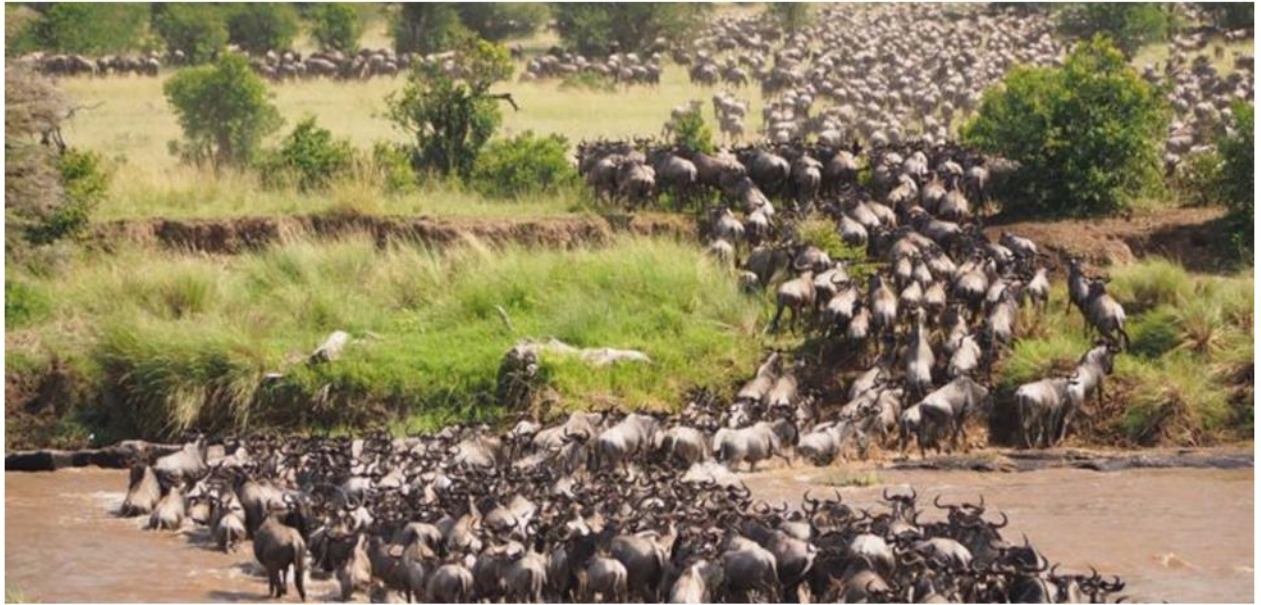
The Great Serengeti Migration

The great Migration of the Serengeti is considered one of 'The Ten Wonders of The Natural World', and one of the best events in Tanzania to witness. A truly awe-inspiring spectacle of life in an expansive ecosystem ruled by rainfall and the urge for survival amongst the herbivores of the Serengeti plains.